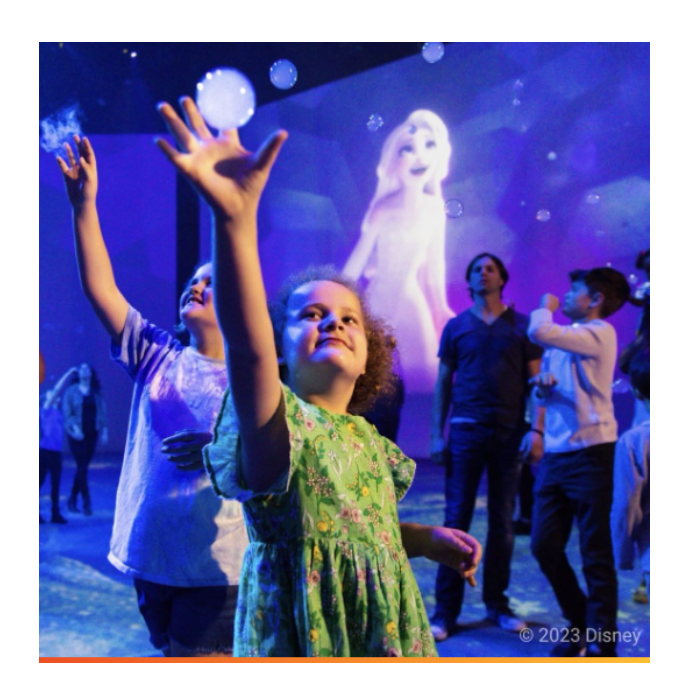
For Tickets and More Information