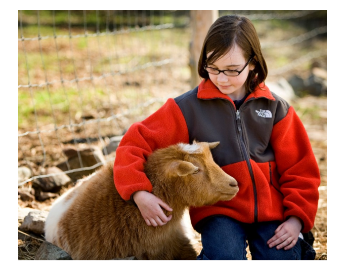
Weir River Farm 140 Turkey Hill Lane Hingham, MA 02043 Sensory-Friendly Programs - The Trustees of Reservations