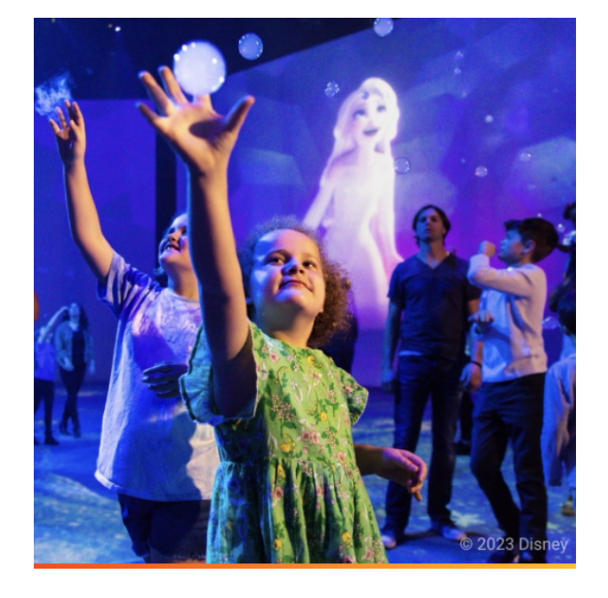
For Tickets and More Information