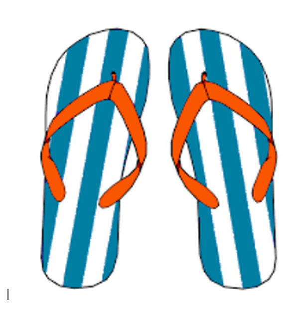
RSVP now as this event will fill up quickly!