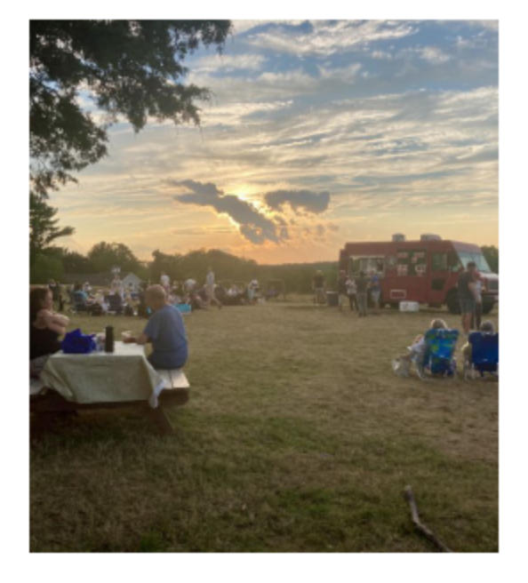
Weir River Farm 140 Turkey Hill Lane Hingham, MA 02043

<u>Sensory-Friendly Programs - The Trustees of Reservations</u>