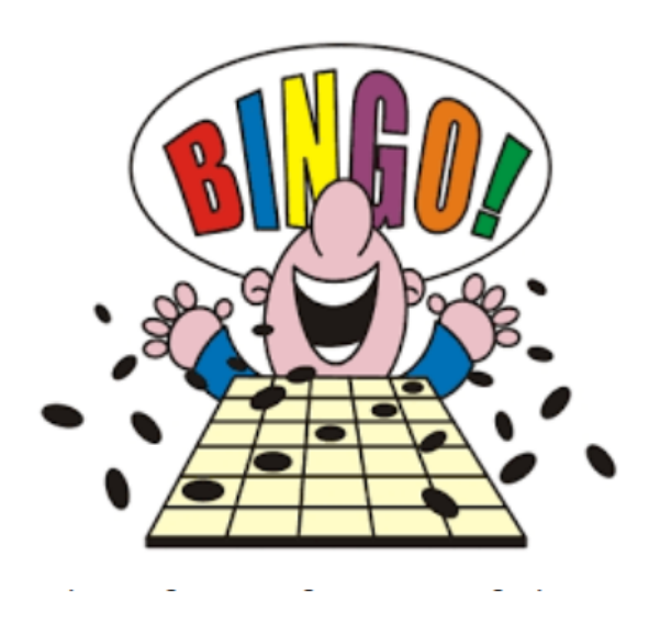
For More Information & To Register